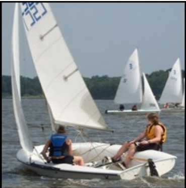
Optimist & Topper Sailing dinghy