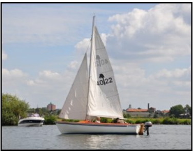
Dutch Stockpaard Keelboat