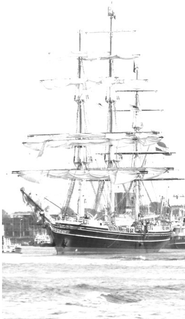
Sailing Club established 1973